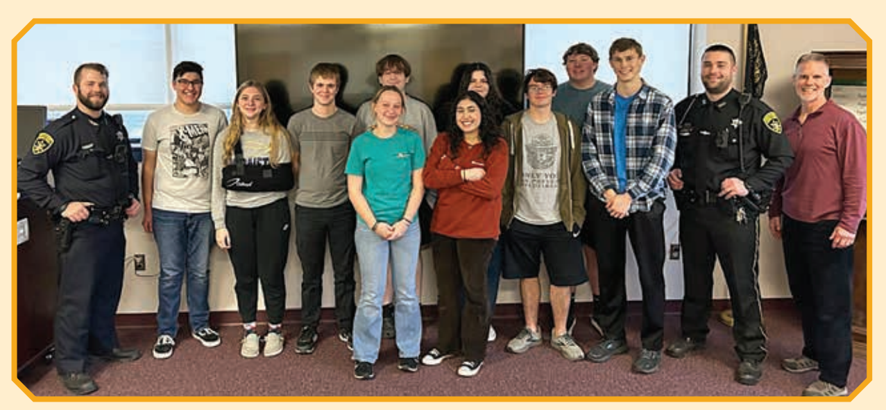
On Monday, Dec. 18, 10 seniors were welcomed by the Broome County Sheriff's Office to take a tour of both the Law Enforcement and Corrections divisions, as well as learn more about the work done by law enforcement every day to help keep our community safe.

Thank you, Broome County Sheriff's Office, for this great opportunity for some of our seniors!